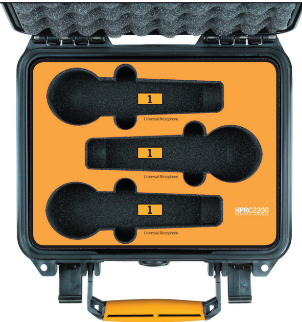
1 Universal Microphone