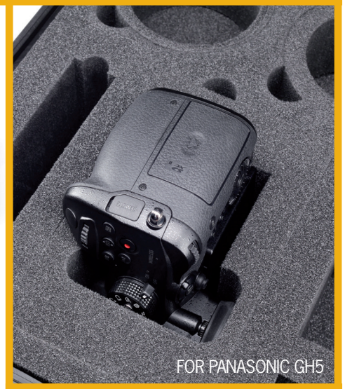
FOR PANASONIC GH5

HPRC2460 for PANASONIC GH5 is a special edition, designed to safely carry your GH5 Lumix G Series.